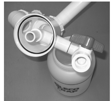
Properly seated O-Ring