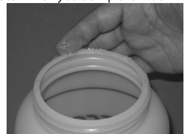
Petroleum Jelly on rim